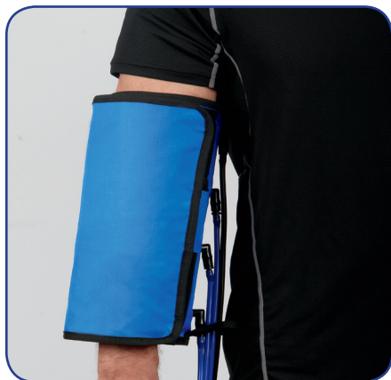
BioCryo Elbow GC-3035-EC