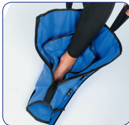
BioCryo Ankle GC-3045-A