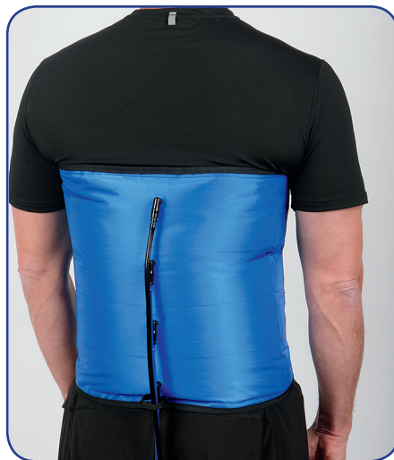
BioCryo Back GC-3035-B