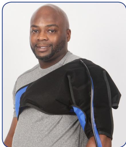
BioCryo Shoulder GC-3035-SH-C