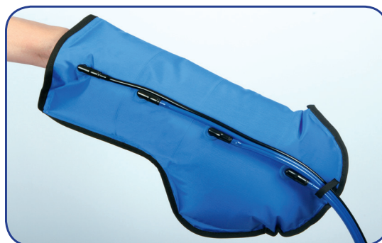
BioCryo Hand/Wrist GC-3035-H-W