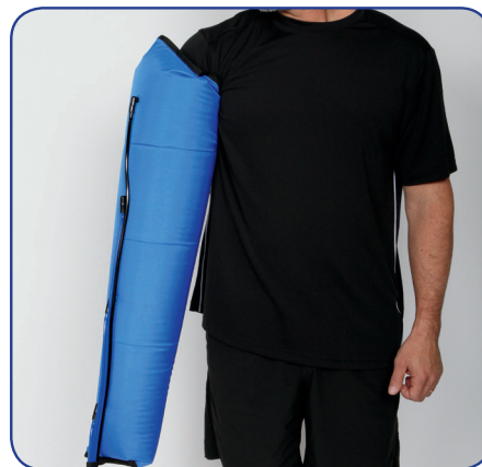
BioCryo Full Arm GC-3035-L (Available in S/M/L)