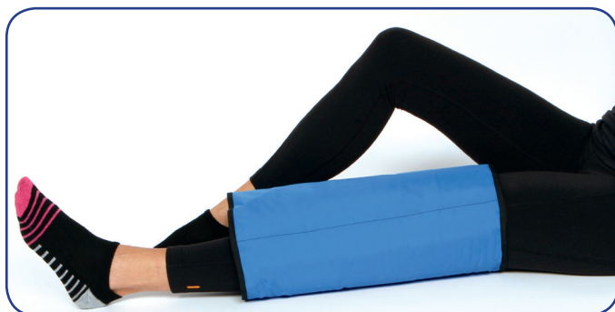
BioCryo Knee GC-3045-KC