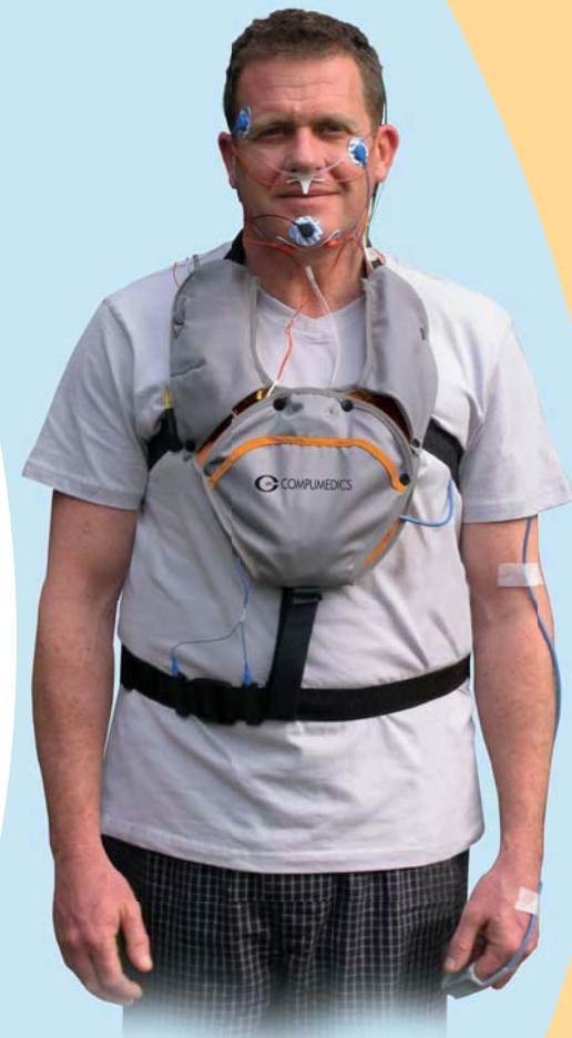
Optional EZ Vest for use with Somté PSG

Since 1987, Compumedics Limited has emerged as a world leader in the design, manufacture, and sales of diagnostic sleep, neurophysiology, research and transcranial Doppler systems. Compumedics design expertise in the area of portable physiologic recorders and wireless data transmission is just one reason for our continued growth. Compumedics is improving people's lives through innovative products, exceptional service and a full range of consumables and accessories brought to you by dedicated people who care.