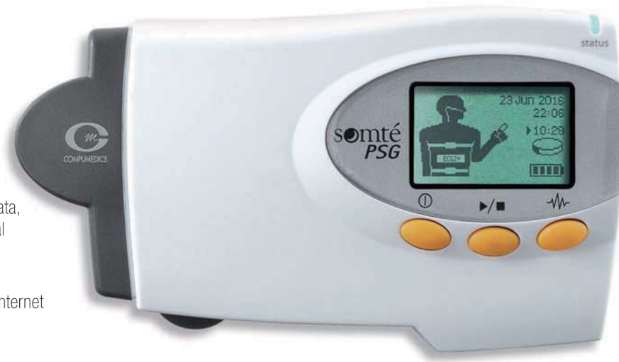
Pictured actual size